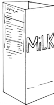
milk carton (cut both ends off)