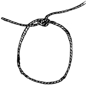
string tied in a loop

Find some of these items around your home and try dipping them in bubble solution and using them to blow bubbles. Circle the ones that work the best!