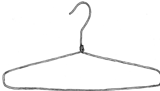
a wire coat hanger (bend it into a fun shape)