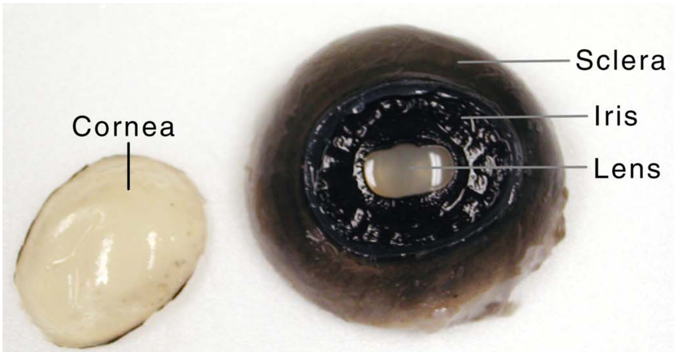
Front View of Anterior half of eye (with cornea removed)