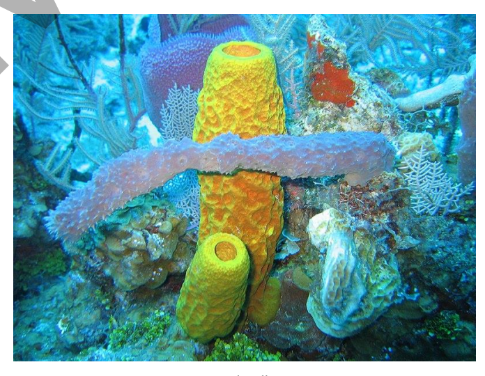
Figure 44. Grey and Yellow Sea Sponges.

Crude oil is toxic if ingested, so animals can die when a crude oil spill occurs. These crude oil spills can cause damage in other ways. For example, a sea sponge can soak up crude oil making it difficult for the animal to access nutrients that it needs from water. Sea sponges are filter feeders, so they are unable to access food another way. Crude oil can either clog up the feeding tubes of a live sponge or can give off toxins that kill it.