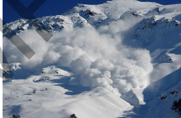
Figure 11. The Avalanche is Moving Rock.

Both the list of mechanisms for weathering and mechanisms for erosion seem similar or have many of the same mechanisms listed. This is because both weathering and erosion are geological processes that work together in the altering of landscapes.