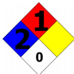
NFPA SCALE (0-4)