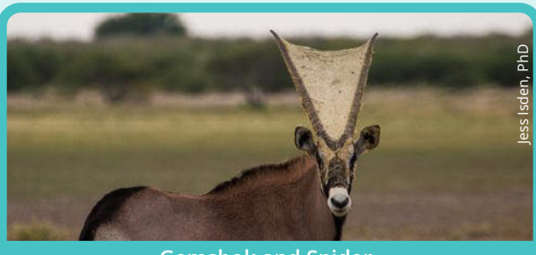
Gemsbok and Spider