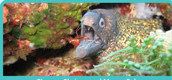
Cleaner Shrimp and Moray Eel