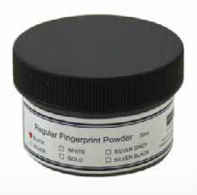
Fingerprint Powder, Black