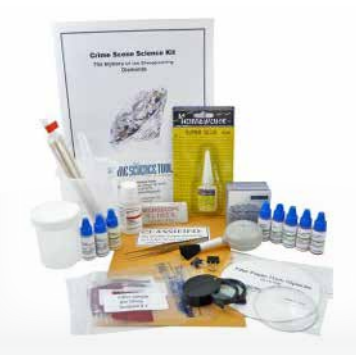
Crime Scene Science Kit 7 fun experiements See all related products