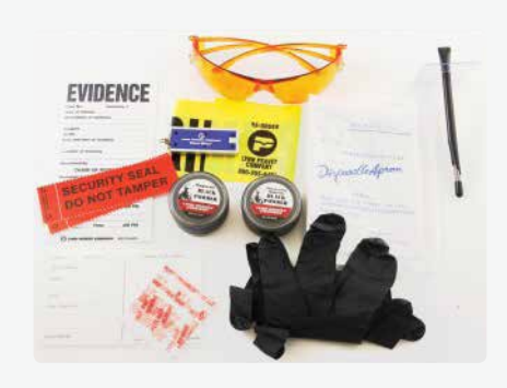
Forensics Kit Pro