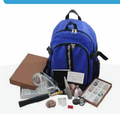
Rock Hound's Backpack Kit See all related products