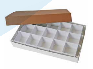
Collection Display Box Store and display your finds