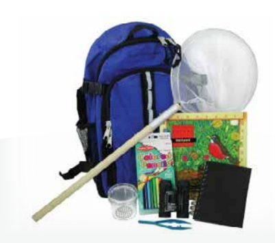
Backyard Naturalist's Backpack Kit Everything your young explorer needs See all related products